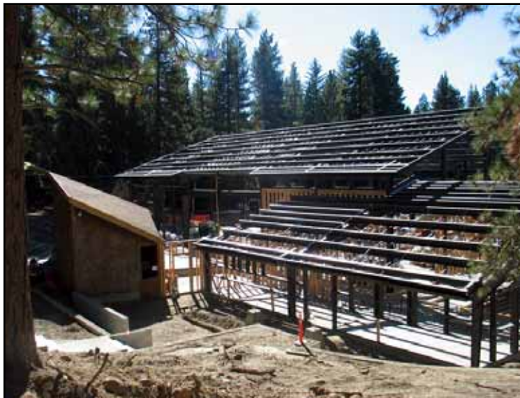
Peace Center in progress.