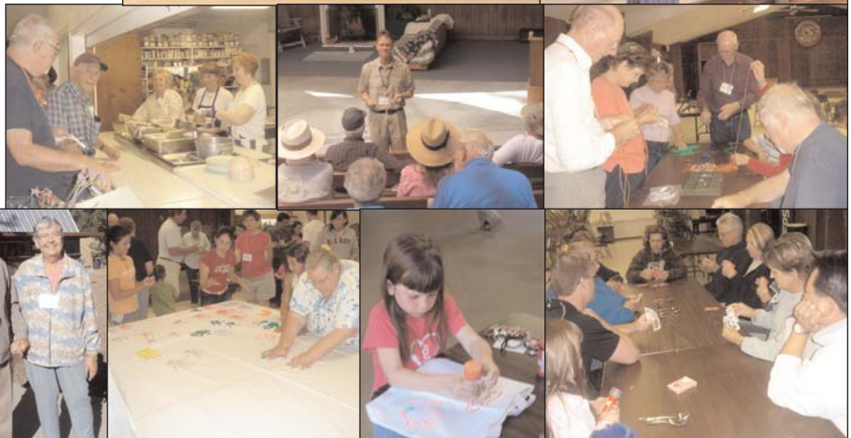
Peaceful surroundings, worship, learning, crafts, games, food and fellowship prevailed throughout the week at the SCMC Reunion.