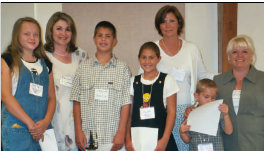
Simi Valley youth receive Outstanding Youth Award at conference