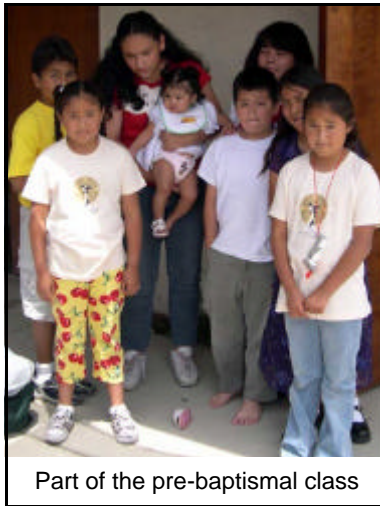
Part of the pre-baptismal class