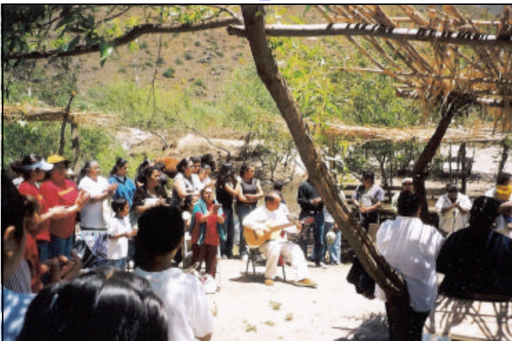
Baptism service in Baja

It's been a busy month! Mother's Day is always a major holiday in the Hispanic community. This year the mothers of La Nueva Esperanza were surprised by a barbecue held after church. Carne asada and salsa made for good fellowship. Ten women (and one very young one) also had a women's night out for Mother's Day.